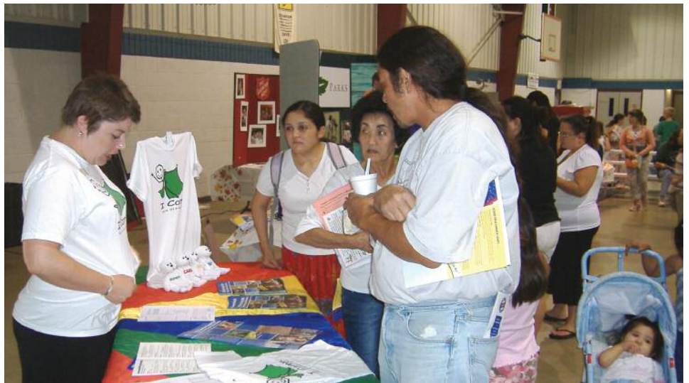
Parents inquiring about summer camps throughout Tulsa.

Many participants are looking forward to Passport to Summer Fun in the future!