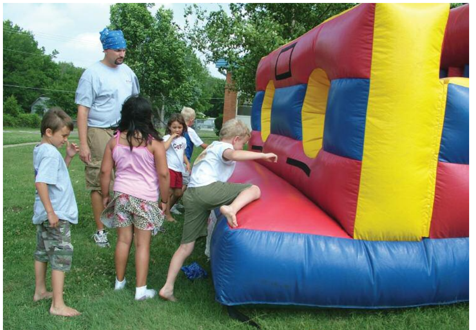
Tulsa Indian Youth Program Wellness Camps meet for one week sessions at Addams Elementary from 8:30 am-noon, July 17-21 grades 2 & 3, July 24-28 grades 4 & 5.